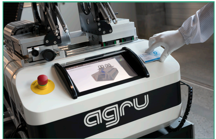
Fully automated welding process