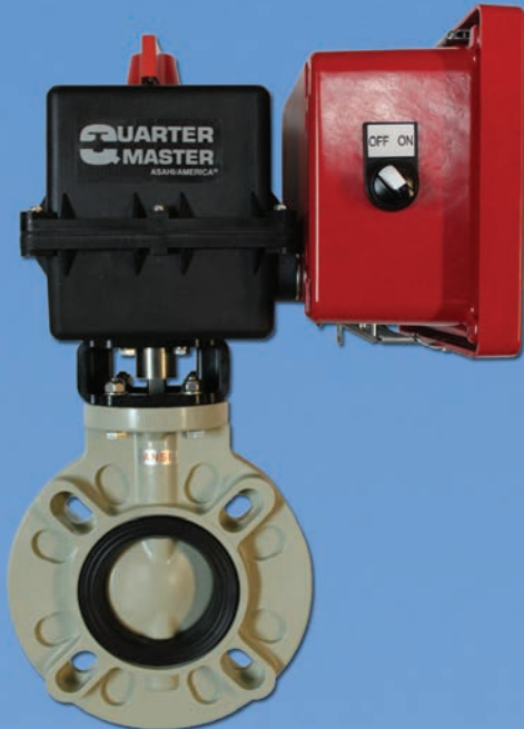
QM Remote Cycle™ w/ Series 94 Actuator & Type-57 Butterfly Valve