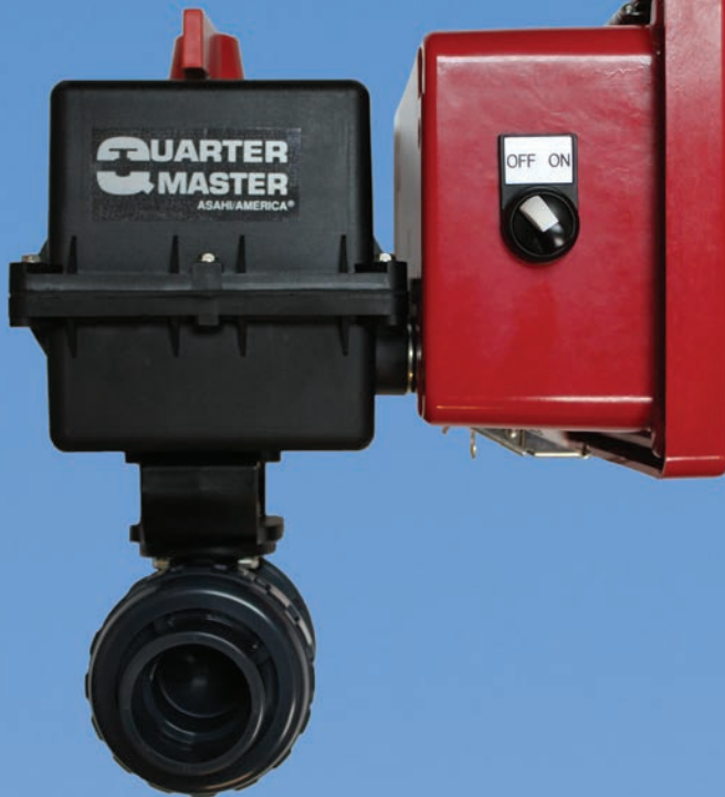
QM Remote Cycle™ w/ Series 94 Actuator & Type-21 Ball Valve