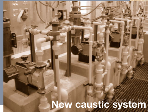
New caustic system