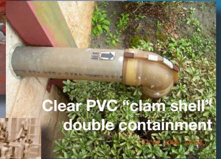
Clear PVC “clam shell” double containment