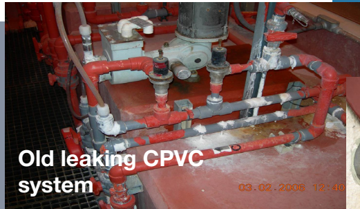
Old leaking CPVC system

A wastewater treatment plant in Georgia needed to upgrade their chemical and scrubber system. Their old leaking caustic system was painted red. The entire piping system, from the chemical room to point-of-use, had to be replaced due to multiple failures both above and below ground. The original CPVC carrier, clear PVC “clam shell” double containment system had failed underground. Asahi/America had the solution.