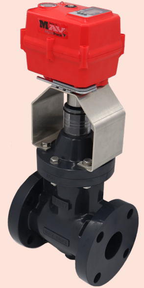
Gate Valves Sizes: 1-1/2" - 4"